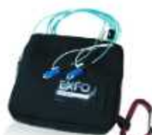
EF launch fiber (SPSB-EF-C30)

Whether for expanding enterprise-class businesses or large-volume data centers, new high-speed data networks built with multimode fibers are running under tighter tolerances than ever before. In the event of failure, intelligent and accurate test tools are needed to quickly find and fix the fault.